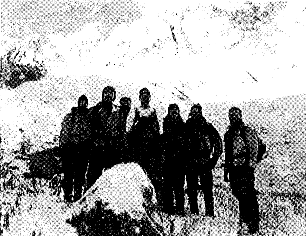
At least these AMCLers are cool after a rainy, snowy night on Mt. Sneffles in Colorado. Read about this less than perfect outing on page 12.

What happens after that is up to them and you.