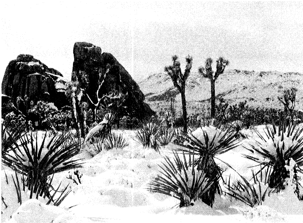
Early goes to this year's Joshua Tree Thanksgiving woke to several inches of new snow on Sunday, not the usual daytime shirt-sleeve weather most had expected.

It's winter camp for grownups, folks, and although it was one of the coldest in memory for part of the time, the rest of the trip was warmer than usual. Hope you all come back next year.