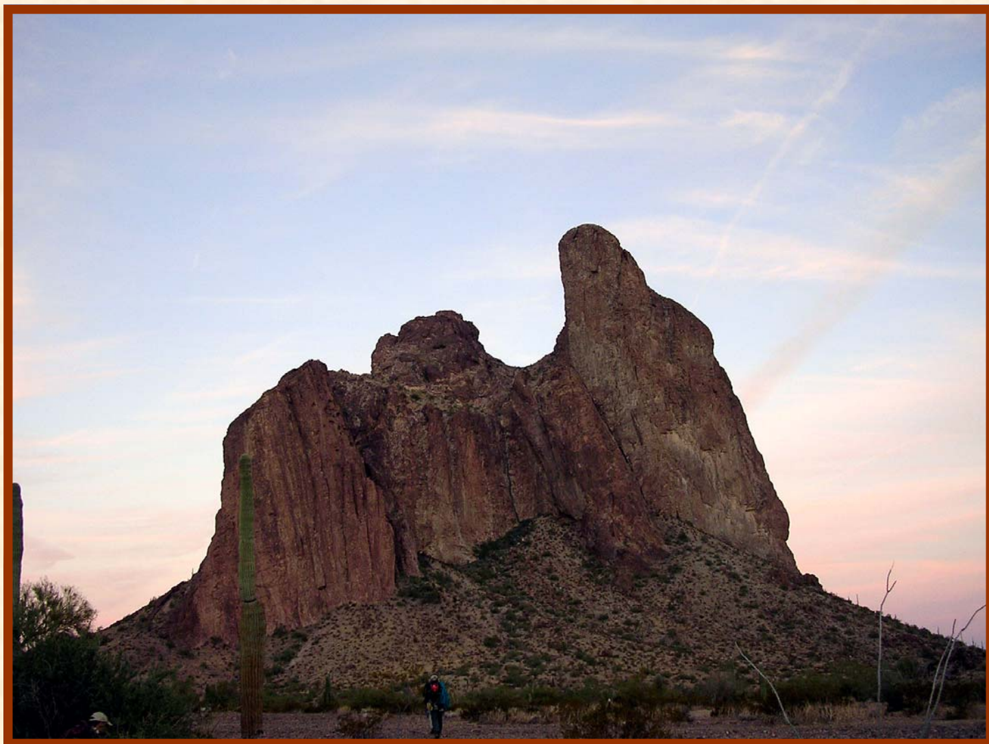
Courthouse Rock - AMC'rs tell their story in the next issue