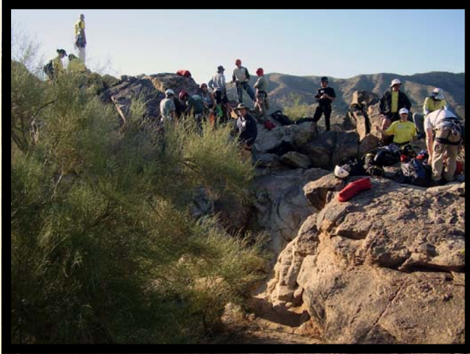
Students practicing Anchors skills at Teddy Bear Wall