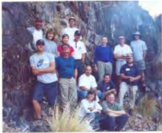
Here are the Alpine Seminararians at the conclusion of their November 5th exercise north of Piestewa Peak. Safety on loose rock and balancing speed with security were central lessons.