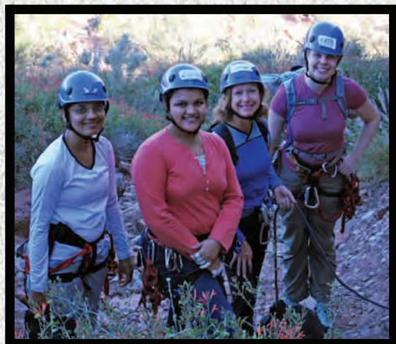
Grad Climbers - The Monk