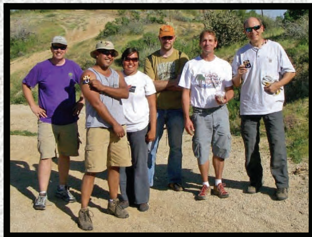
Grad Climbers - Rosetta Stone