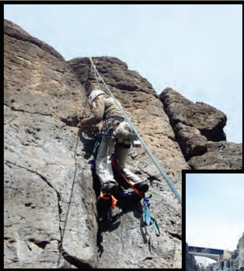
Lead school students practice on aid climbs at Sullivan Canyon