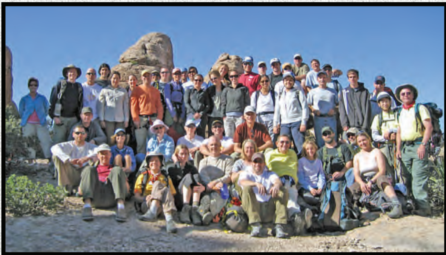
Outdoor Rock Climbing Class - Spring 2009