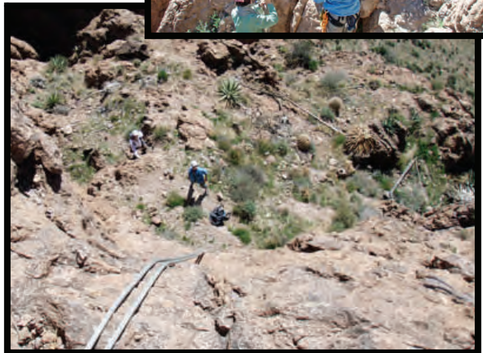
The first of several rap- pels off the Needle