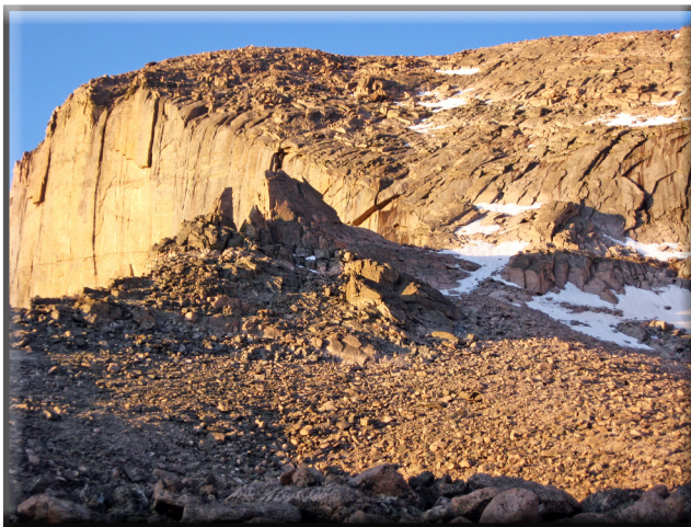
The North Face of Longs Peak

We left the Longs Peak trailhead at 1:30 a.m. For the 16 hours we saw nothing but people! Seriously the whole thing was like “Piestewa Peak” on a spring morning. There was a constant steam of headlamps throughout the night. We left the hordes at the Boulder Field and headed straight up to Chasm View, where we could look horizontally across at 4 different teams on various routes on the Diamond.