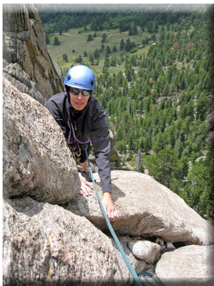
2nd Pitch - White Whale

After locating the proper “Cables route” I was surprised to see about 50% of it covered in a half inch of black ice. What appears to have happened this year is that Colorado has had a lot of precipitation, which fell as snow up high, so the summer snows melted during the day but ran down over the cliffs and froze at night. Being the north face, and that the Cables route ascends a dihedral, much of the resulting ice simply stayed through the daylight in the shady recesses of the rock.