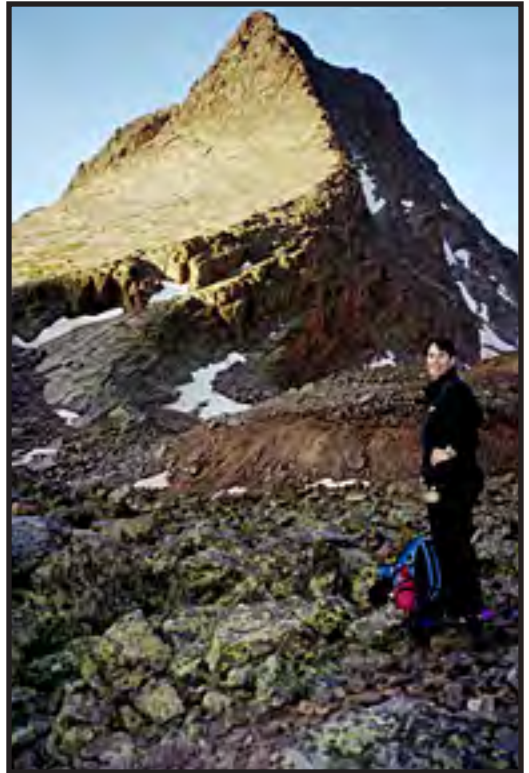
Wham Ridge - Vestal