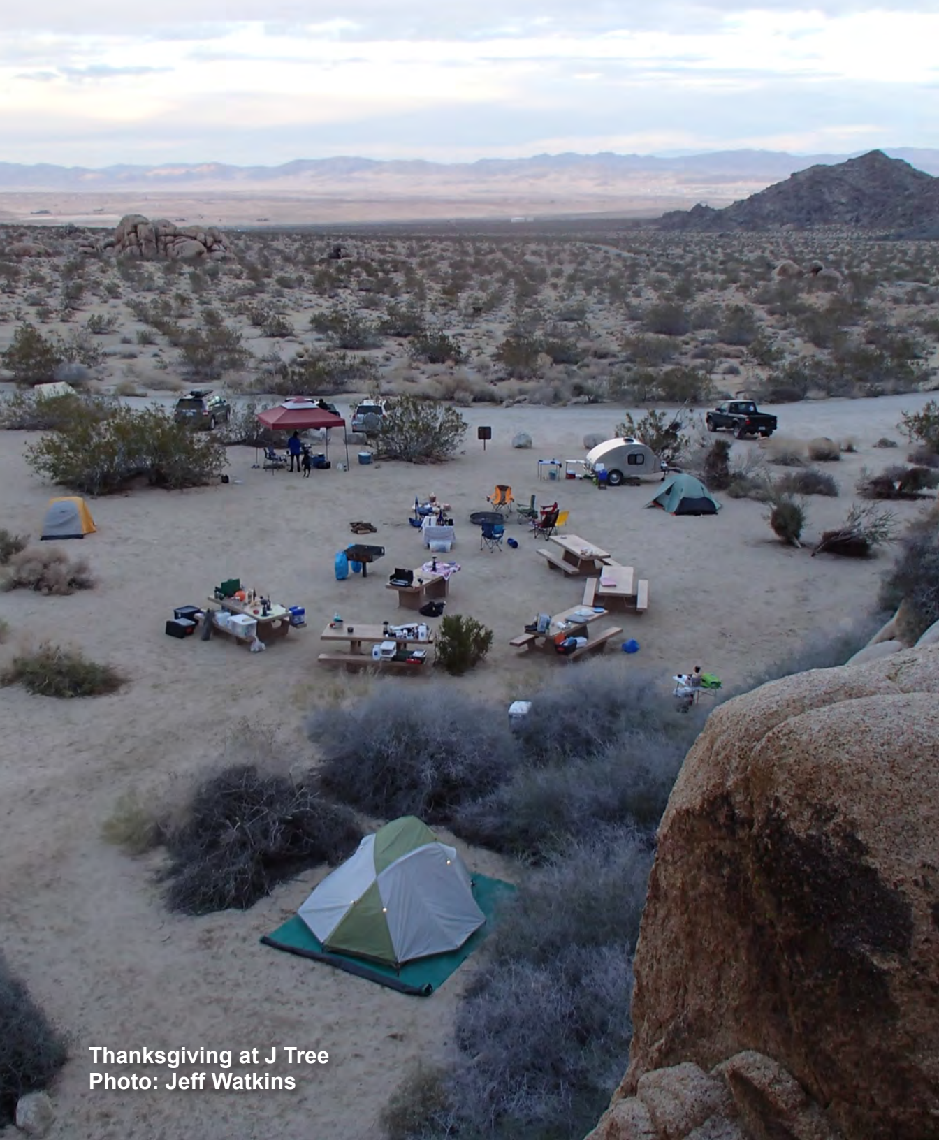
Thanksgiving at J Tree