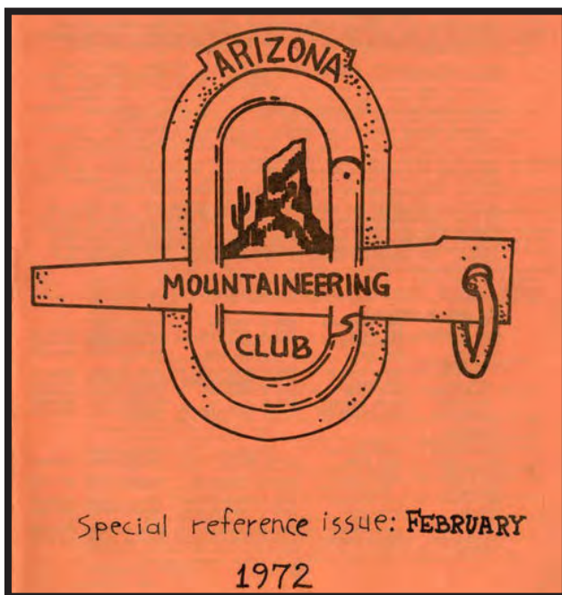
Early issue Arizona Mountaineer