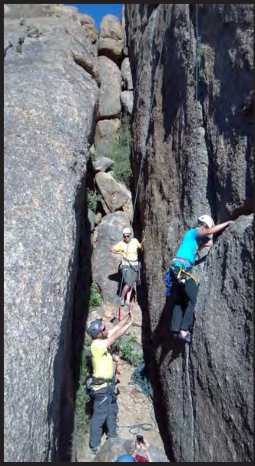
Owl Slot by Peter Ekema