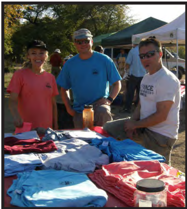
T-Shirt time